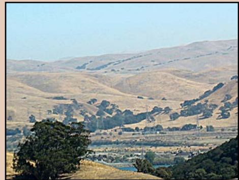
The Sunol Valley, which Jed passed through in 1827