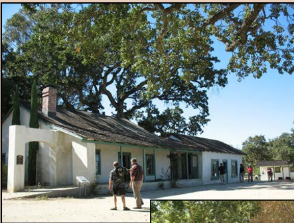
The Alviso Adobe, built in 1854