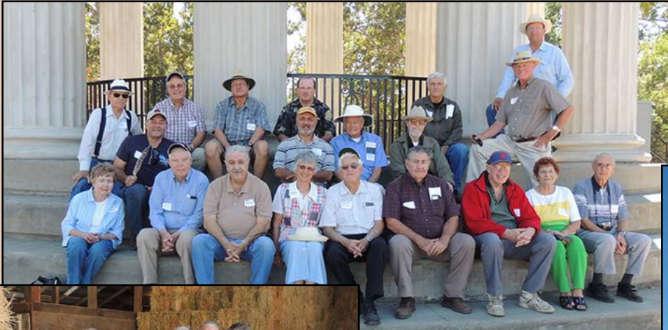
JSS Members at the Water Temple