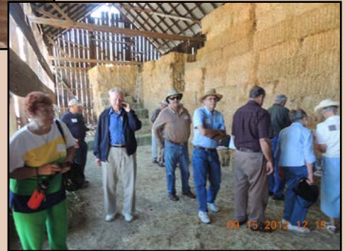
Lunch in the barn at the Koopman Ranch