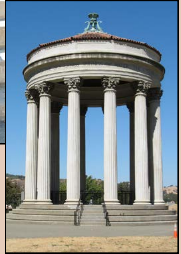
The beautiful Water Temple in Sunol Valley