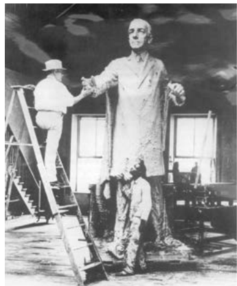
Gutzon Borglum sculpts the likeness of another president, Woodrow Wilson, commissioned for the Polish city of Poznah by the statesman-pianist, Ignacy Jan Paderewski.