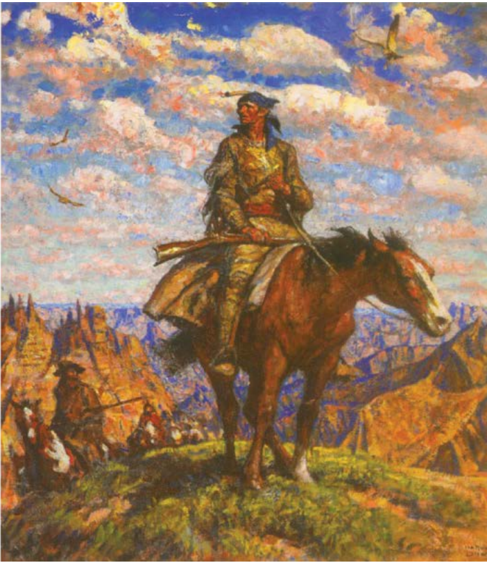
Harvey Dunn's Jedediah Smith in the Badlands (1947) depicts a moment during the 1823-1824 expedition.