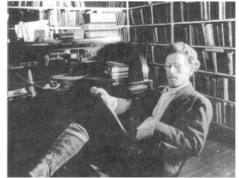
John G. Neihardt reposes in his study in Branson, Missouri, in 1924.

stories in leading magazines in New York and California and had issued his first collection of stories, The Lonesome Trail , most of them tales of the Omaha Indians. Neihardt had published dozens of poems in magazines—in addition to writing dozens of others—and assembled thirty-three