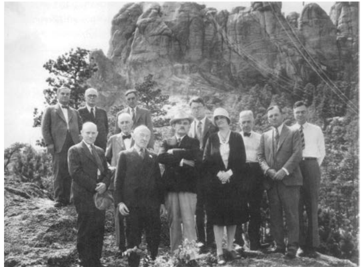
Gutzon Borglum (center, arms crossed) acknowledged “Doane Robinson and the support his great dream enlisted” on this photograph taken at Mount Rushmore in 1932. Robinson, wearing a dark bowtie, stands second from the left in the middle row.