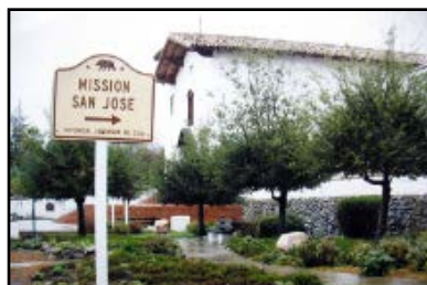
Mission San Jose

Dues Notice: Our Winter 2011-2012 mailing of the "Castor" had some errors as to when your dues would expire and we apologize for any concerns it caused. We have tried to correct these dates which will be found on your mailing label and will show when and what years your dues are delinquent.