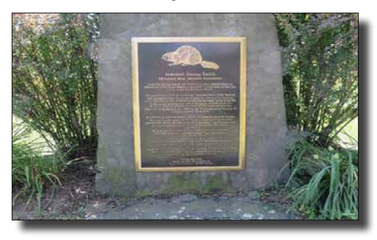
Jedediah Strong Smith Mountain Man, Western Pathfinder

The second monument is located at Pathfinder Park at the north end of the village.