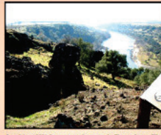
Looking SW from panel towards Turnabout Flat

Visiting the Bureau of Land Management's Redding Field Office on January 15th of this year, I was pleasantly surprised to hear that the long anticipated historic panel, commemorating Jedediah Smith's passage through these Northern California lands, had finally been installed at Jed's Overlook the previous month! Excited to see it, I went the following day and had a pleasant hike to the overlook where I took these pictures, enjoyed the beautiful view and contemplated Jed's travels through this area so many years ago. Thanks to the Bureau of Land Management, this well done panel will help educate and remind us of the significant contributions this worthy man made towards western exploration. This historic panel can be accessed via an easy 1½ mile trail from the Iron Canyon trailhead and parking lot off of California State Highway 36, which is located 7.5 miles northeast of Red Bluff, CA. For further information, contact the BLM's Redding Field Office by phone at 530 224-2100 or connect to their computer web site at www.blm.gov/ca/st/en/fo/redding .